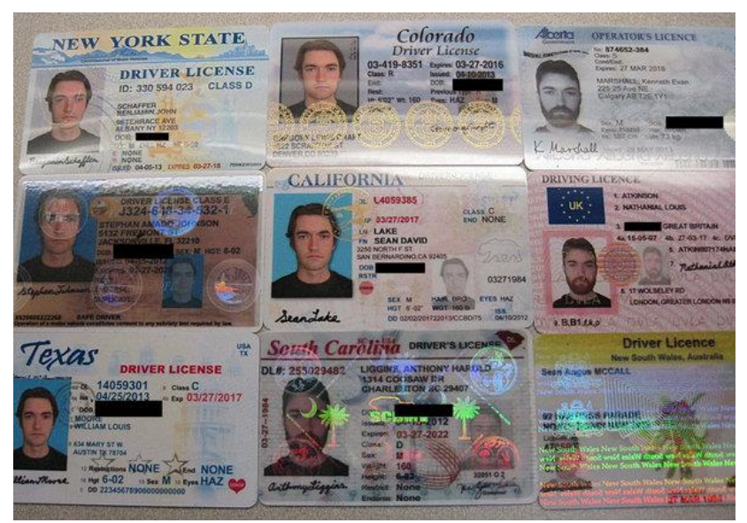
Fake ID cards that the government says were ordered by Ross Ulbricht.

The government says they were found in a package addressed to the group house where he lived in San Francisco and were intercepted by Customs and Border Protection. The United States attorney's office redacted some information on the IDs.