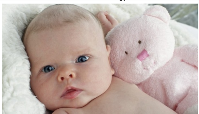
Study Finds Newborn Infants Can Tell If Parents Are Losers News in Brief • Science & Technology • ISSUE 48•12 • Mar 21, 2012