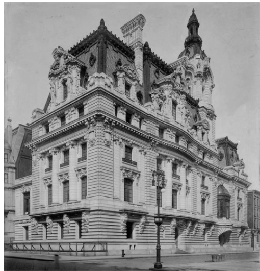
121- room mansion that her father built on Fifth Avenue